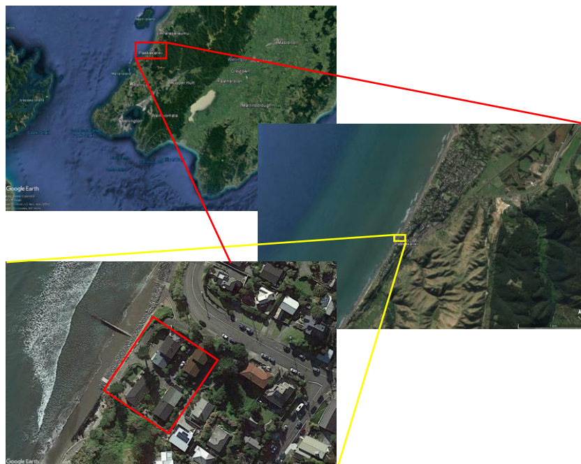
Site location of proposed retaining wall development.